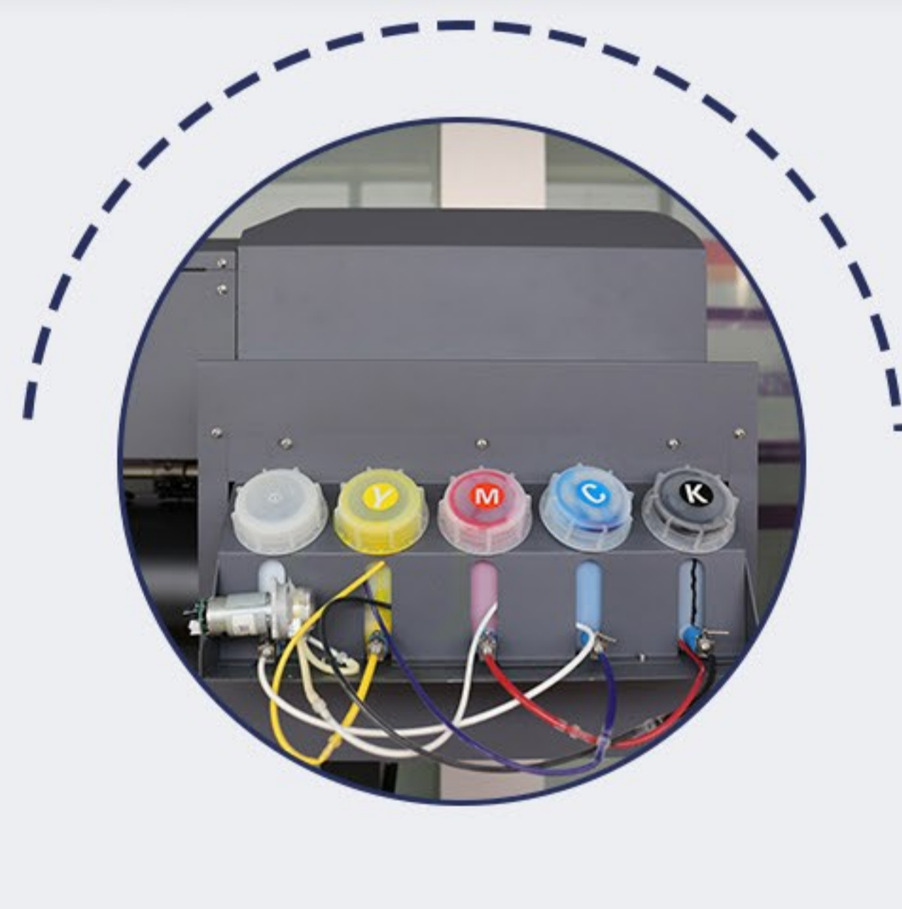
Auto Supply Ink