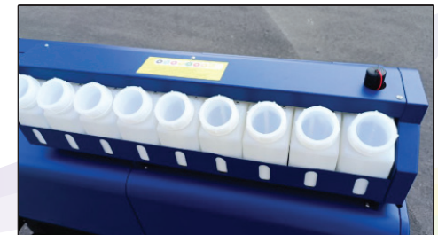
9 Inks: CMYK + Fluo + W